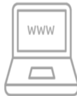
02 Web portal for career guidance