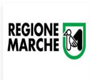
Regione Marche (IT)