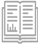
01 Guidelines for teachers

This project aims to reach its objectives with the creation of six intellectual outputs: