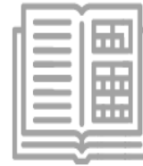
03 A quality framework for career guidance