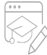
06 E-learning platform for teachers and practitioners