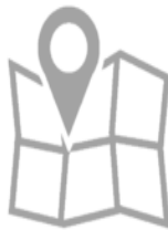
04 Web map device