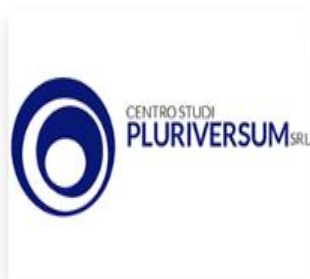
Centro Studi Pluriversum (IT)